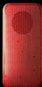
SOUND SYSTEM PHONE